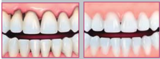
LEFT: Without brushing and flossing, bacteria have the potential to damage your gums which could eventually lead to tooth loss. RIGHT: Research has shown that we see teeth as whiter when they are surrounded by pink gums.

Periodontal disease can not only cause tooth loss and other issues in the mouth, it can also wreak havoc in your whole body. Perio issues have been linked to a host of health problems. So, get your periodontal issues treated as soon as possible!